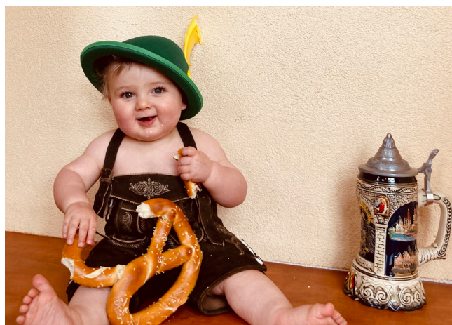
*Previous winner shown