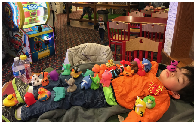
*Previous winner shown

Submit your Photos to our Photo Contest today!