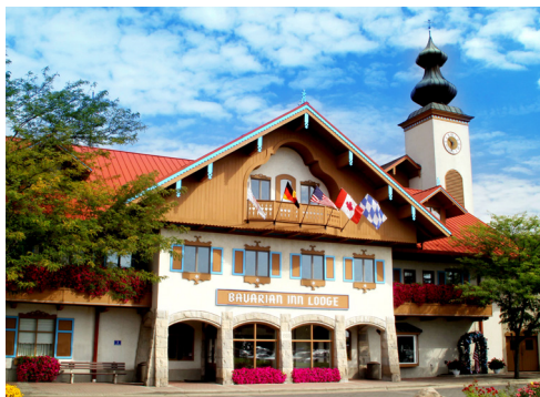
Bavarian Inn Lodge One Covered Bridge Lane Frankenmuth, MI 48734 989-652-7200