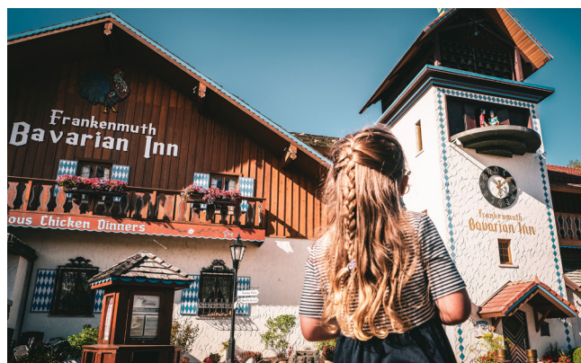
*Previous winner shown