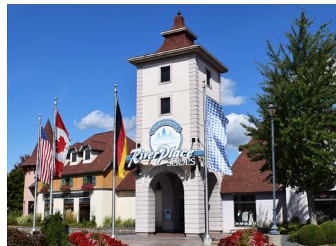
Frankenmuth River Place Shops 925 S. Main St. Frankenmuth, MI 48734 1-800-600-0105

Stay informed and updated on our current events happening at the Bavarian Inn by following our social media! #BavarianInn #RiverPlaceFun