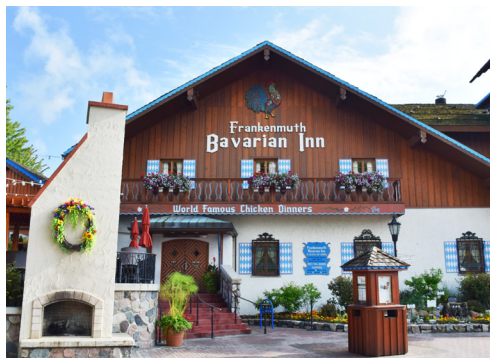
Bavarian Inn Restaurant 713 S. Main Street, Frankenmuth, MI 48734 989-652-9941

We hope you enjoyed your time here in Michigan's Little Bavaria!