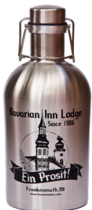
STAINLESS STEEL GROWLER

Take home your favorite beer from the Bavarian Inn Lodge with one of our specialty growlers shown below.