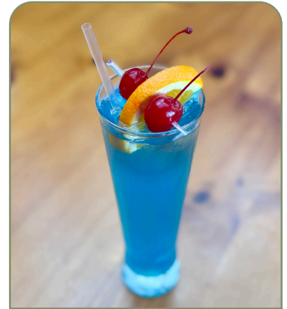
THE BAVARIAN BLAST

Enjoy Buffalo Trace Bourbon Cream with our signature root beer, topped with whipped cream. Smooth, sweet, and just for adults! $13.50