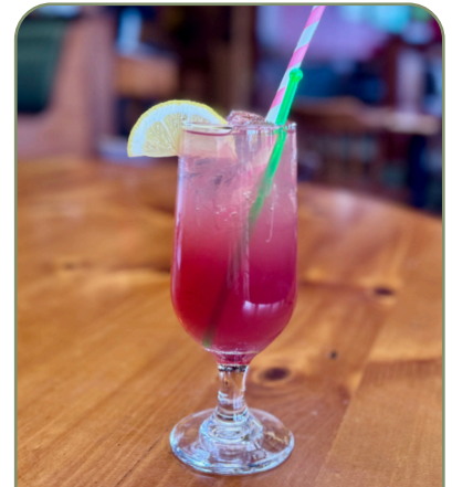
BLACKBERRY BOURBON LEMONADE